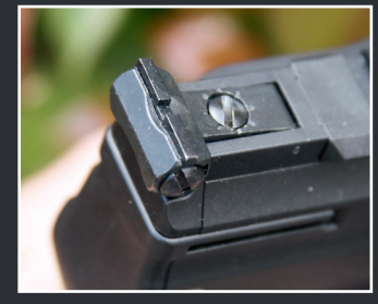
The rearsight is adjustable, simple and easy to use.