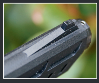
Nothing fancy at this end, either - but it works.