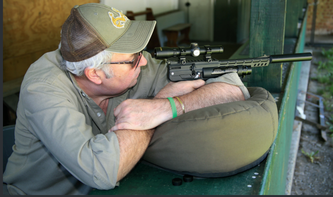
Hmmm ... if I fit a rifle scope, I could shoot like this. Or I could just learn to shoot a pistol properly. Yes, let's try that option.

THE HW44 Anyone who is remotely familiar Weihrauch HW110 rifle