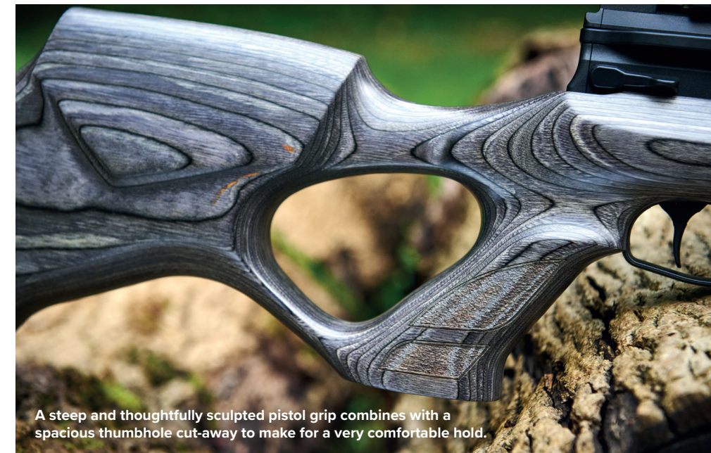
A steep and thoughtfully sculpted pistol grip combines with a spacious thumbhole cut-away to make for a very comfortable hold.