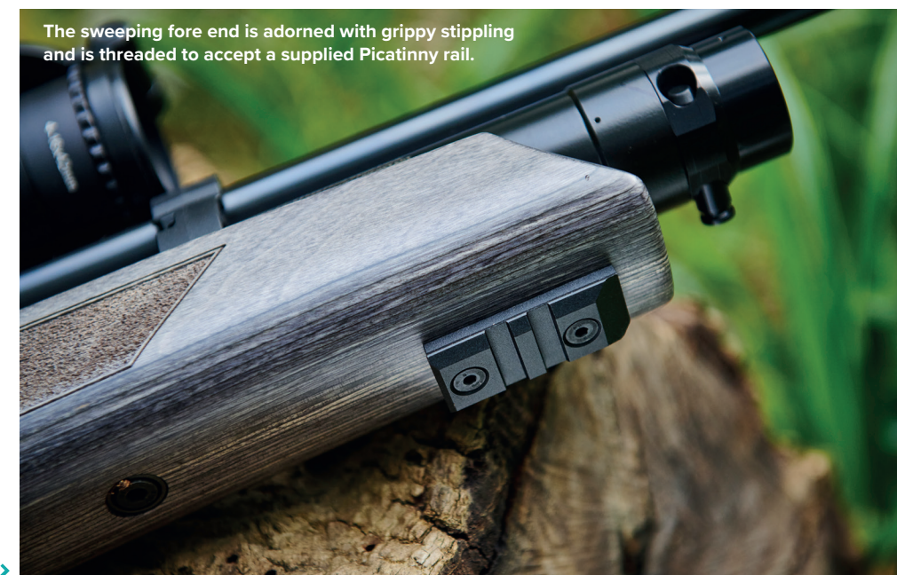
The sweeping fore end is adorned with grippy stippling and is threaded to accept a supplied Picatinny rail.

I really like sidelever actions and the updated cocking mechanism on this model is very good. UK distributor Hull Cartridge can even reverse the lever to the opposite side for left-handers, or you can order a left-hand version when you buy. I found it to be well-positioned