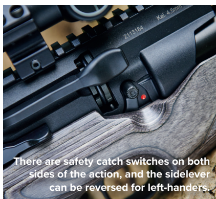
There are safety catch switches on both sides of the action, and the sidelever can be reversed for left-handers.