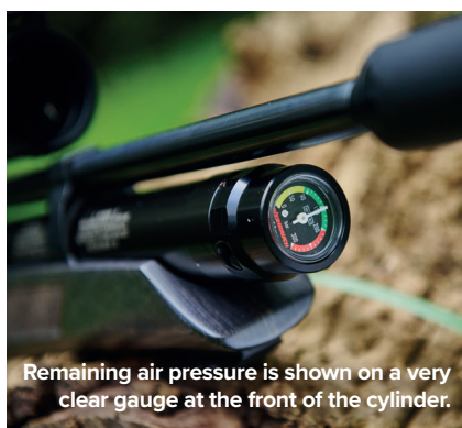
Remaining air pressure is shown on a very clear gauge at the front of the cylinder.