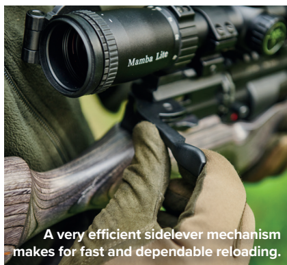
A very efficient sidelever mechanism makes for fast and dependable reloading.