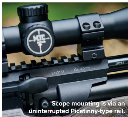
Scope mounting is via an uninterrupted Picatinny-type rail.