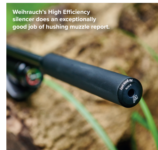
Weihrauch's High Efficiency silencer does an exceptionally good job of hushing muzzle report.