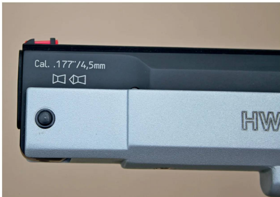
177 is a good calibre for an HW45.