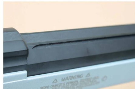
You can mount a scope, laser or red dot on the 11mm sight rail.

handed shooting stance, too, but I recommend the two-handed style due to the HW45's weight.