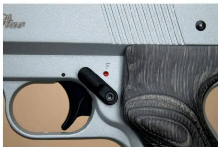
A red dot appears when on the left side of the Silver Star when the safety catch is on 'fire'.