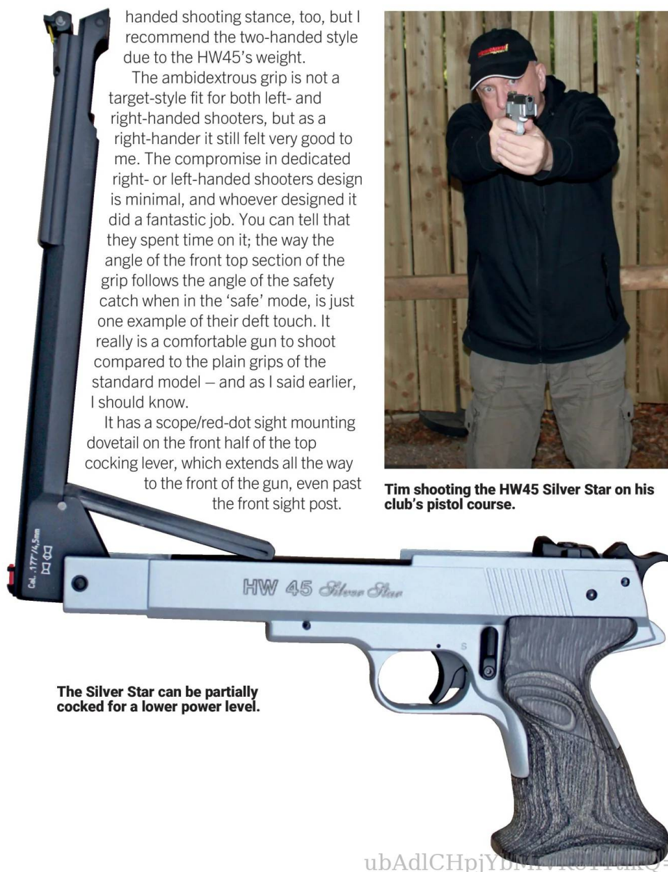
The Silver Star can be partially cocked for a lower power level.