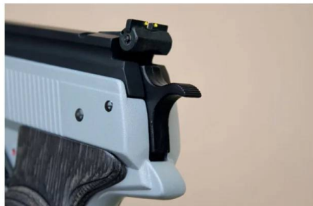
The action is locked down with the faux hammer.