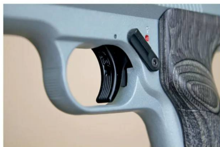
Having grooves on the trigger blade helps with trigger control on this recoiling air pistol.