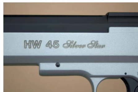
The classy script of Silver Star.