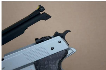
Pulling the faux hammer back releases the over-lever.