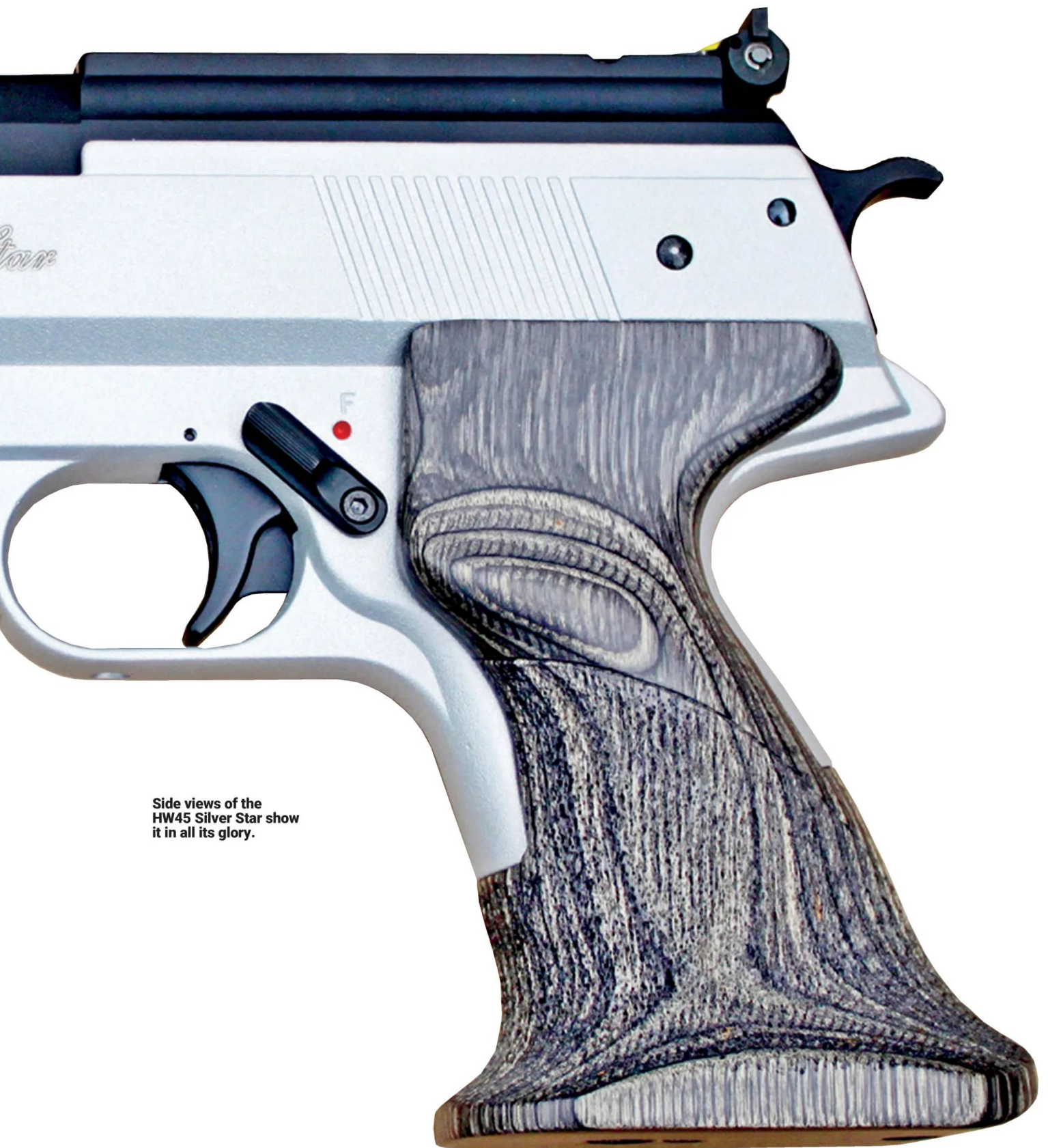
Side views of the HW45 Silver Star show it in all its glory.