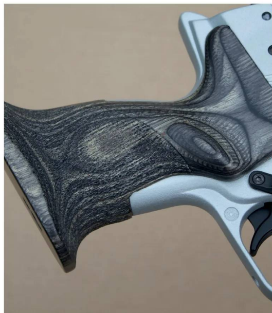
The upgraded Silver Star grip is ambidextrous.

the spring pressure on the trigger sears, the lighter the trigger pressure will be. At 2½ ft. lbs., the factory-set trigger measured in at 1.67kg (3lbs 11oz). At full power, the trigger weight went up to 2.3kg (5lbs 3oz).