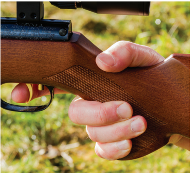
The sporter stock on the HW 95K lets you adopt a conventional hold...