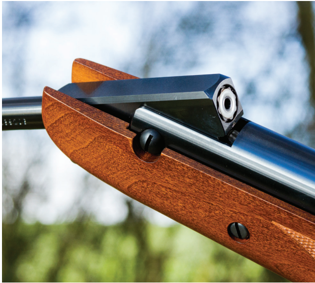
The breech block displays the calibre – .177 in this case .22 is also available as standard, with .20 and .25 special orders for £85 extra

less than the size of a five-pence piece – a result with which I'm extremely happy. But while shooting paper targets when evaluating a new rifle is necessary to see how well both the rifle and shooter are performing together, shooting reactive targets is far more enjoyable. To this end, I proceeded to shoot some coloured chalk discs with a 24mm diameter back at the 30-yard mark – with a 100% success rate in zero wind. I haven't yet taken the 95K hunting, but have no doubt that it would despatch rabbits – my favourite airgun quarry – with ease. As for the moderator, it's true that springers don't benefit as much as PCPs when it comes to hushing down the sound, but the moddy