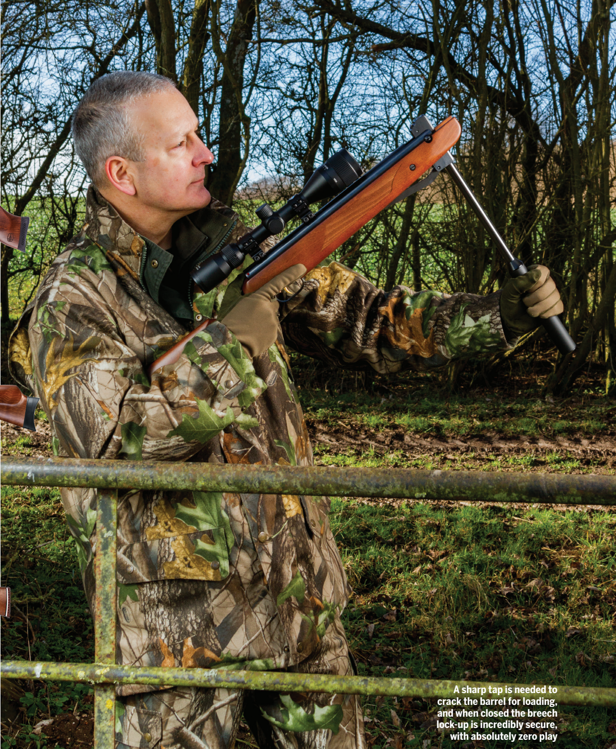
A sharp tap is needed to crack the barrel for loading, and when closed the breech lock-up is incredibly secure, with absolutely zero play

ON TARGET Firing the rifle with the forend resting lightly in the palm of my leading hand, which in turn was resting on a shooting bag, the 95K would happily group under a 10-pence piece – and if I were a better shot with springers, I'm sure this could be tightened even further. Reducing the range to 25 yards saw the groups shrink to one-hole groups