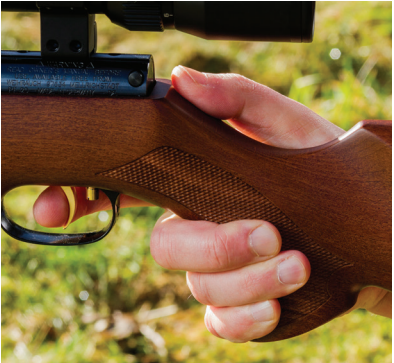
...And while there no dedicated thumb shelf, there is a nice flat area that gives you the option of adopting the thumb-up hold

shooting. I'd love to carry out this test again after a couple of thousand more shots. I've known people who've fettled their 95s, either using a drop-in kit themselves, or sending them off to be tuned, but I have to wonder whether there's much to be gained when the rifle is such a smooth operator to begin with.