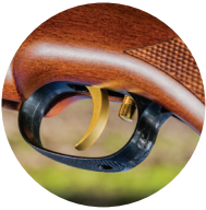
The trigger weight adjustment screw is located behind the blade. It can be adjusted with a screwdriver via an access hole in the metal trigger guard

weighed pellets of 8.4 grains, the 95 produced a variation of just 7.6 feet per second over 10 shots, with an average muzzle velocity of 781 feet per second to give a muzzle energy of 11.37 foot-pounds. It would be interesting to see if this spread reduced any further after more