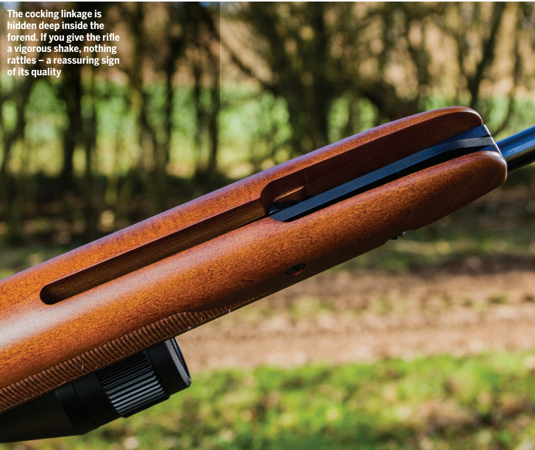
The cocking linkage is hidden deep inside the forend. If you give the rifle a vigorous shake, nothing rattles – a reassuring sign of its quality

fitted to the 95K is far more than just an elaborate cocking aid. Shooting the rifle outdoors, especially in an open field rather than the confines of woodland, the moderator seems to make little difference to the noise – which is fairly minimal in any case. But it's when you shoot the rifle indoors that you appreciate just what