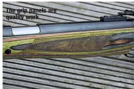
The grip panels are quality work