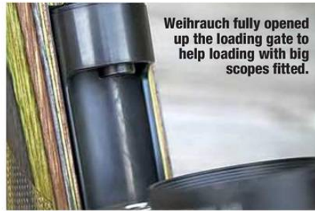
Weihrauch fully opened up the loading gate to help loading with big scopes fitted.