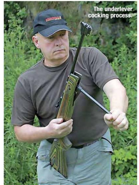
The underlever cocking process.

during the loading process; I know it's fitted with an anti-bear trap device, but do not rely on such things.