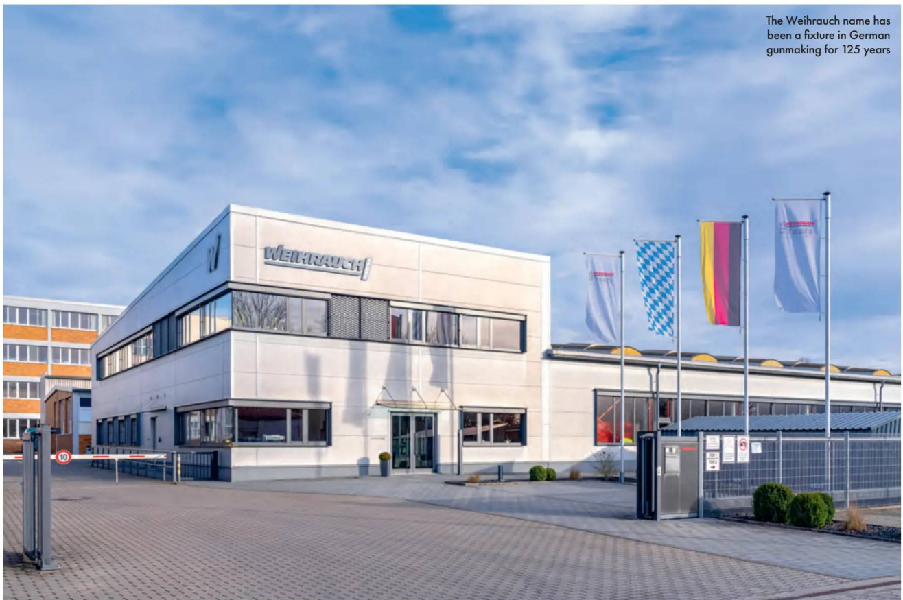
The Weihrauch name has been a fixture in German gunmaking for 125 years